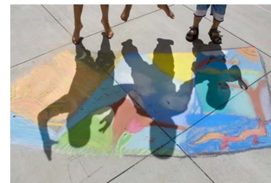
Cragmont E.S., Berkeley, CA