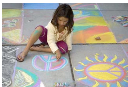
Berkeley, CA

Official color of CHALK4PEACE: 2008- PURPLE 2007- GREEN 2006- ORANGE